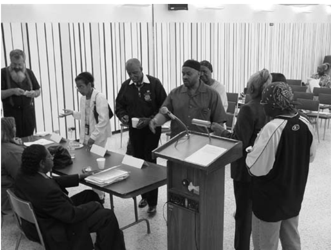
Attendees questioned the speakers at the Housing Forum